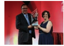
Tsuu T'ina Nation Aboriginal Economic Development Corporation Award Laureate