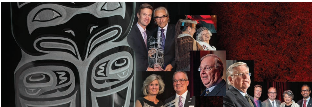
Table at the gala dinner and two seats at the head table

Promotion and prominent mention of sponsorship in all advertisements, press releases, CCAB event e-blasts, e-newsletters, and other award communications