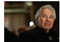
Senator Murray Sinclair 2016 Award for Excellence in Aboriginal Relations Laureate